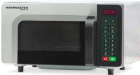
Low Volume Commercial Microwave Oven