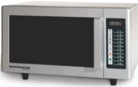
Medium Volume Commercial Microwave Oven