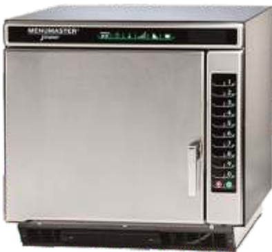
High Speed Combination Jetwave Oven (Convection & Microwave)