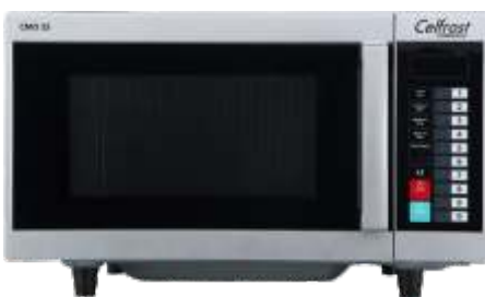
Low Volume Commercial Microwave Oven