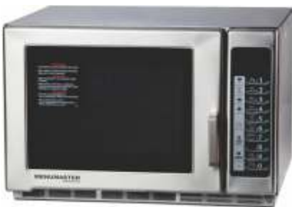
Medium Volume Commercial Microwave Oven