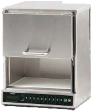
Heavy Volume Commercial Microwave Oven