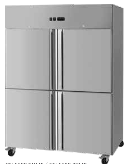
GN 1500 TNME / GN 1500 BTME