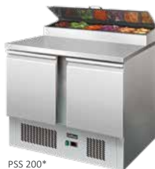
PSS 200* PSE 201* (Also available in 3 doors model PSS 300* & PSE 301*)