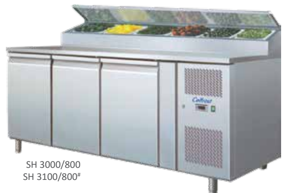
SH 3000/800 SH 3100/800*