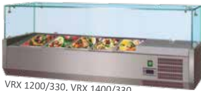
VRX 1200/330, VRX 1400/330