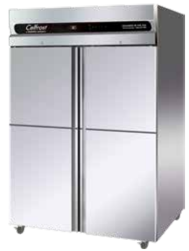
GN 1410 TNM (New)/ GN 1410 BTM (New) GN 1200 TNM*