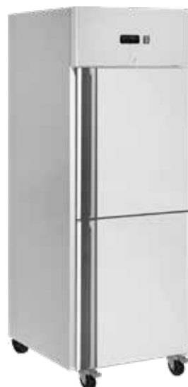
GN 700 TNME / GN 700 BTME