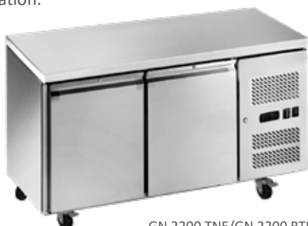
GN 2200 TNE/GN 2200 BTE (Also available in 3 door models GN 3200 TNE/GN 3200 BTE)

Bigger space inside due to Insulated Evaporator at top in Reachins with all essential features like Removable gaskets, heavy duty castors, GN compatible, Danfoss / Embraco Compressor, Slide out Condenser unit (in undercounters), Digital controller, lock and many more to make it user friendly and hassle-free operation.