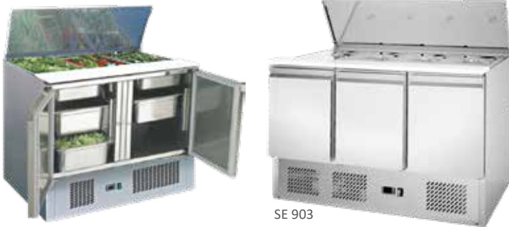
S 900/SE 900

The Saladettes come with a refrigerated GN compatible top (Pans not included) that can take in frozen yogurt toppings, salads etc. It also has a night cover. 2/3 Door Refrigerated section underneath is handy to store additional foodstuff. The Countertop display comes with a glass sneeze guard; is equipped with its own refrigeration unit and accepts GN ¼ pans (not included).