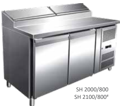
SH 2000/800 SH 2100/800*

Celfrost Professional Prep Counters desserts and more. Mounted on castors and available in 2 and 3 doors, frost free & static with fan assist cooling variants.