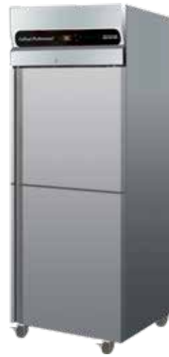
GN 650 TNM (New)/ GN 650 BTM (New) GN 600 TNM / GN 600 BTM*