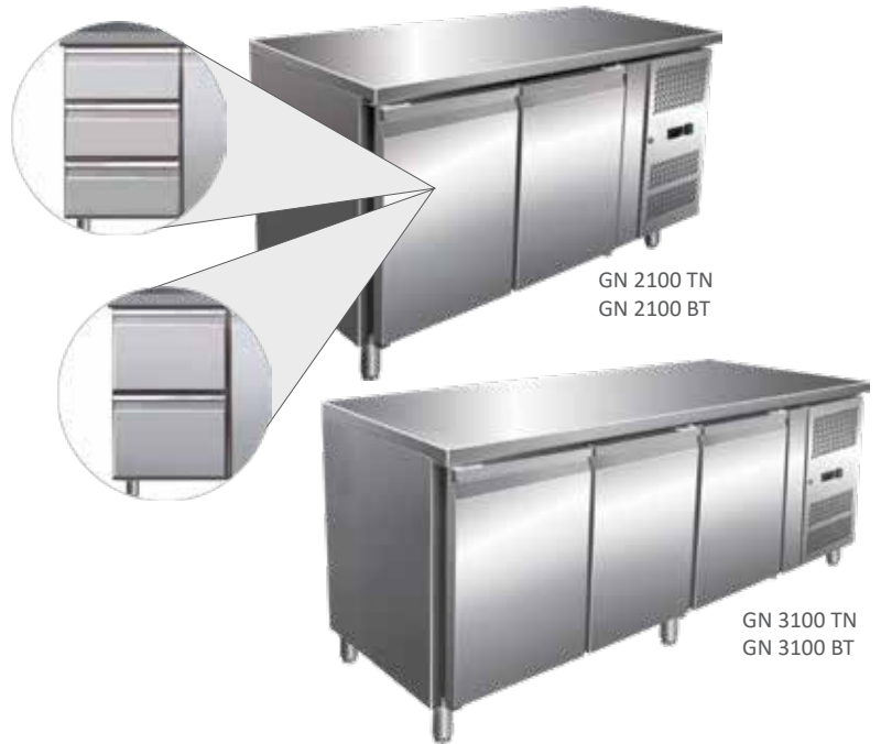
GN 2100 TN GN 2100 BT