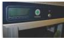
Large Control Panel