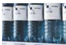
Stable and strong shelves

You have the possibility to choose an accessory lock that prevents unauthorized access to the products.