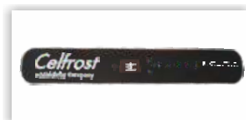
Digital temperature display