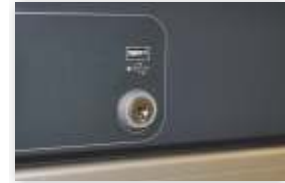
USB Data Logging