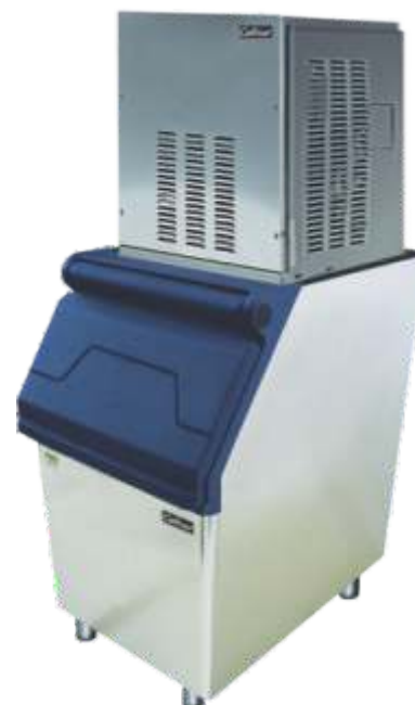
IF-200 on IB-105 Bin