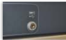
USB Data Collection Point