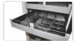
Adjustable Drawers (Optional)