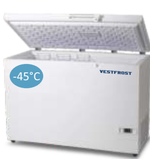
VT 147 VT 307

These Vestfrost low temperature freezers create the possibility to maintain temperatures as low as -45°C (VT 147 & VT 307), upto -60°C (VT 407) and upto -86°C (VT 78 & VT 408). Supreme stability, reliability, user-friendliness and ease of cleaning make these freezers an ideal solution for laboratories and hospitals. Nature R refrigerant, cyclopentane insulation combined with recyclable materials make the freezers extremely eco-friendly.