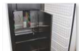
Internal Lids + Shelves