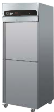
GN 650TBM (New) / GN 650BTM (New)