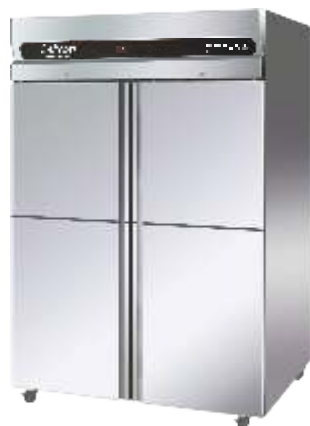
GN 1410TBM (New) / GN 1410BTM (New)