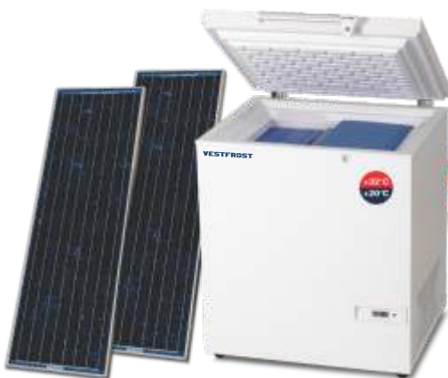
MKS 044 with Solar Panels*

Based on the unique Solarchill ice bank technology, the Vestfrost MKS 044 functions safely without use of energy storing batteries or contaminating fuel. Solar panels supply the necessary power and the icebank provides a reliable temperature in the vaccine compartment – even when the sun is absent for days. The temperature is controlled and maintained via self-regulating convection between icebank and vaccine compartment.