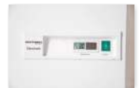
Solar driven display