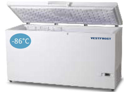
VT 78 VT 408