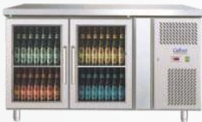
Undercounter Back Bar (GN 2100 TNG)

Elegant yet reliable Undercounter Back Bars made in sturdy stainless steel that are designed to enhance the efficiency of professional bartenders. Perfect for showcasing bottled and canned drinks and giving you high capacity & high visibility storage and display options.