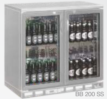
BB 200 SS