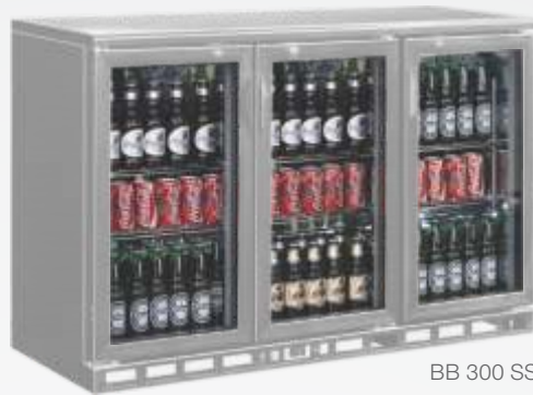
BB 300 SS

High performance Back Bars with refrigerated display, available in elegant black colour and stainless steel that can be specified as part of a complete bar solution or individually.... giving you endless possibilities in bar design. They create maximum display area and allow rapid restocking and cooling. Black Back Bars are highly cost-effective too.