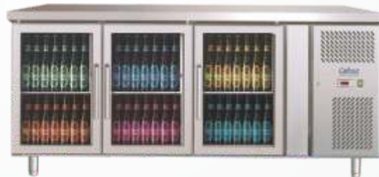
Undercounter Back Bar (GN 3100 TNG)